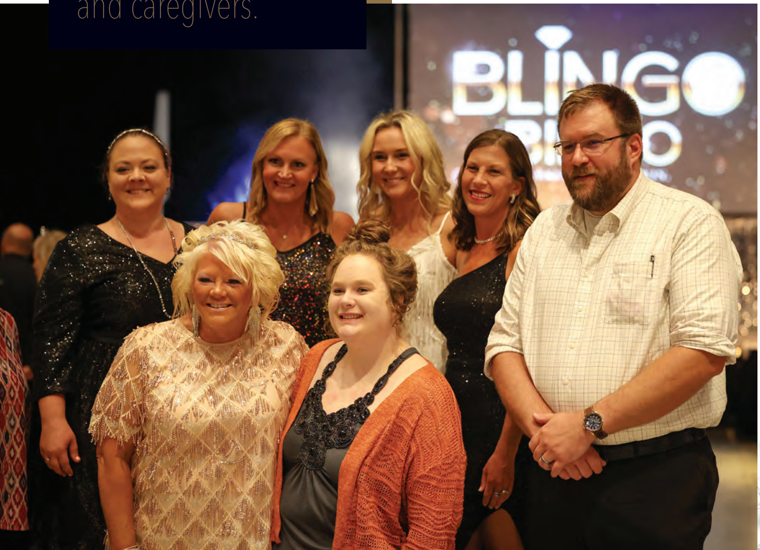
BLINGO BINGO AT MAYO CLINIC HEALTH SYSTEM EVENT CENTER

Blingo Bingo celebrated its second year this summer, and it was clear the event would eclipse its already successful inauguration.