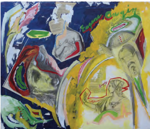
FRONT COVER DESIGN FEATURES A PAINTING BY EMY FRENTZ FROM HER OPERA SERIES ENTITLED EUGENE ONEGIN , AN OPERA BY TCHAIKOVSKY FINISHED IN 1878 BASED ON A NOVEL OF THE SAME NAME BY AUTHOR ALEXANDER PUSHKIN.