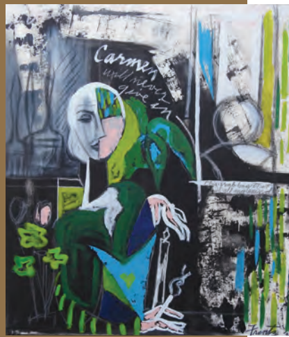
CARMEN, A PAINTING BY EMY FRENTZ, 1982