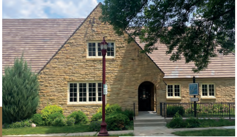
SHARED SPACES AT EMY FRENTZ