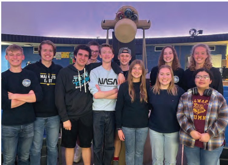
PLANETARIUM PRODUCTION CLUB STUDENTS IN THE MANKATO AREA PUBLIC SCHOOLS PLANETARIUM