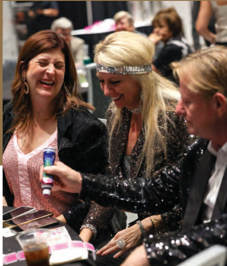
BLINGO BINGO PLAYERS

With over 600 guests in attendance and amazing support from community partners, this year's Blingo Bingo raised over $90,000. But beyond the dollars raised, it's clear that Blingo Bingo does so much more. It provides a space for community, for support and to honor those wanting to live fully alive.